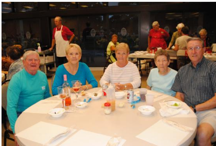
F-24: Thank you for coming out to support us to-night. We appreciate it.