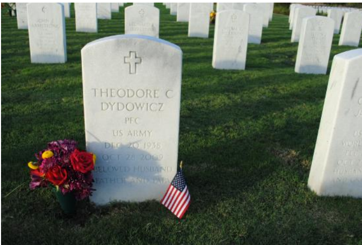
D-26: In looking at some of the stones, you can see inscriptions with the different religious signs at the top of the stones. This one indicates "Christian".