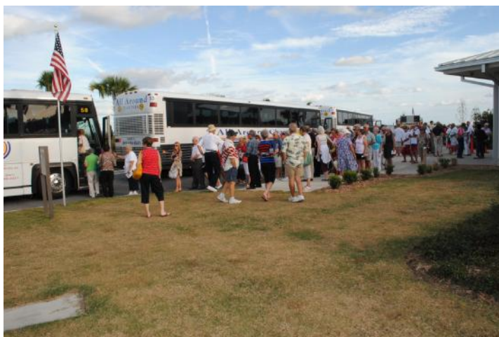
D-23: More buses arrive to take everyone back to Twin Lakes Park.