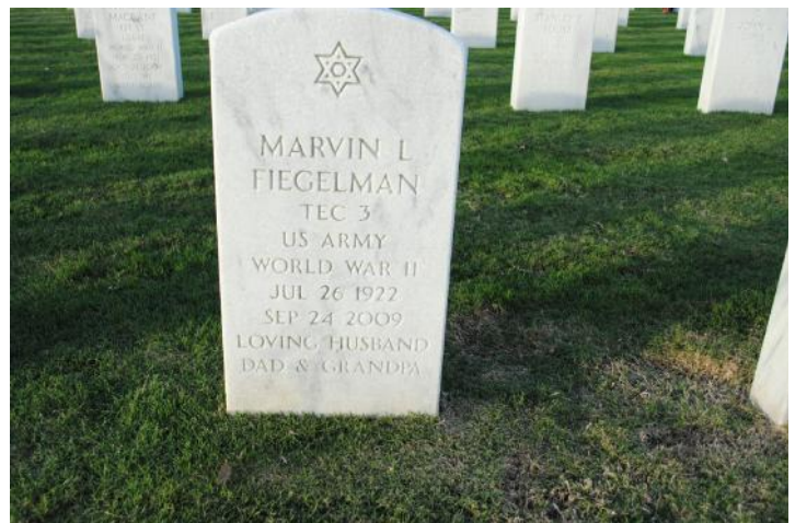
D-27: This one indicates "Judaism" with the Star of David at the top.