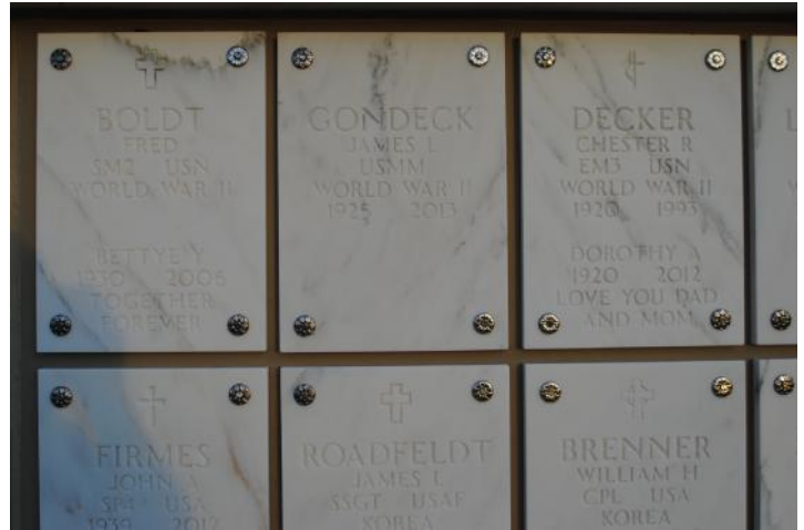
D-31: This is a close-up view of photo D-30. The inscriptions are about the same as on a regular tombstone. Notice the religion icons at the top.