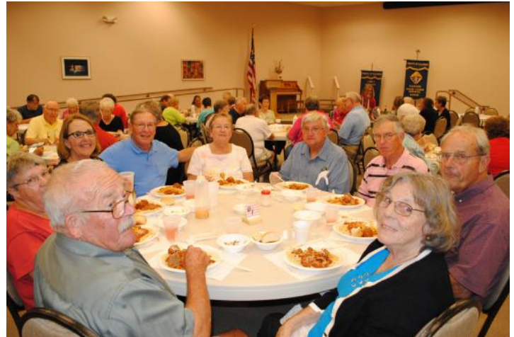
F-18: This is a great group of 9 at an 8-person table.