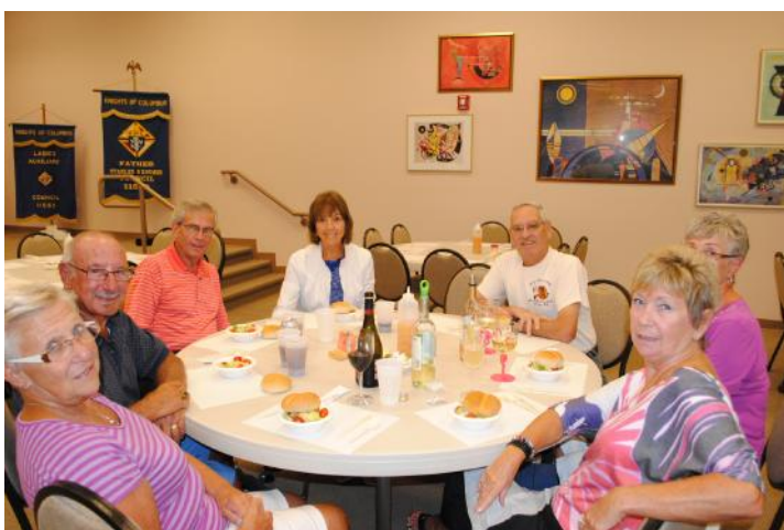
F-07: Another table of 7 getting started with their Salads.