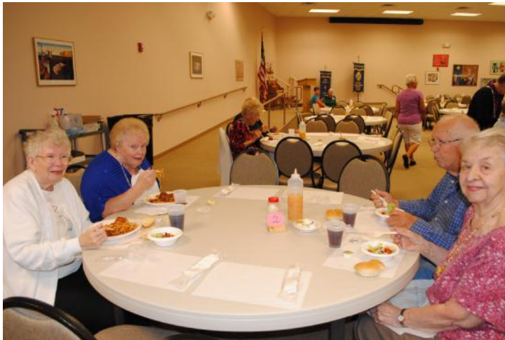
F-06: There are some familiar faces here.