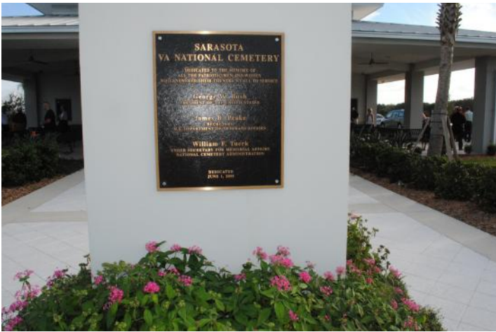
D-24: Browsing around the Sarasota National Cemetery, we see the Founders Plaque in front of the Administration Building.