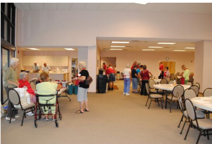
F-01: This is Pasta Dinner night for our K of C 11553. The servers are standing around waiting for The people to come in.