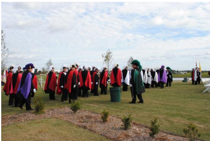
D-12: The color guard forms for the procession into the tent with Bishop Frank Dwayne.