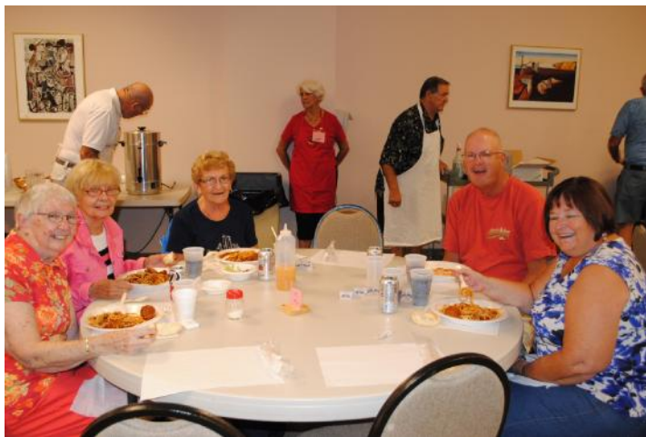
F-22: Thanks again for your support. Also, many thanks to the volunteer workers that you see in the background. They make things possible.