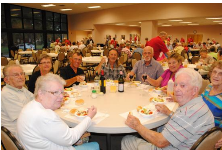
F-13: This is a fun table out to have a good time.