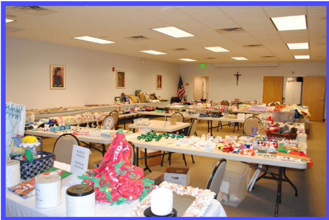
E-01: This is the display room for the CCW Crafts Sale held on Nov 15-17, 2013 at the Parish Activity Center.