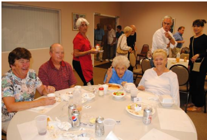
F-38: We thank this group for coming out tonight to help support our K o C 11553.