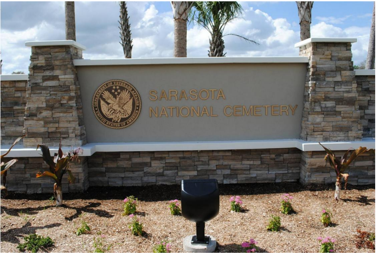
D-36: You can get to the cemetery taking I-75 and going 4 miles east from exit 205.