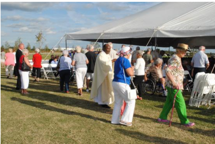
D-20: People receive communion at the sides of the tent.