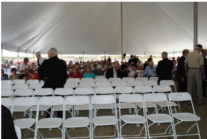
D-14: A view of the inside of the tent from the front.