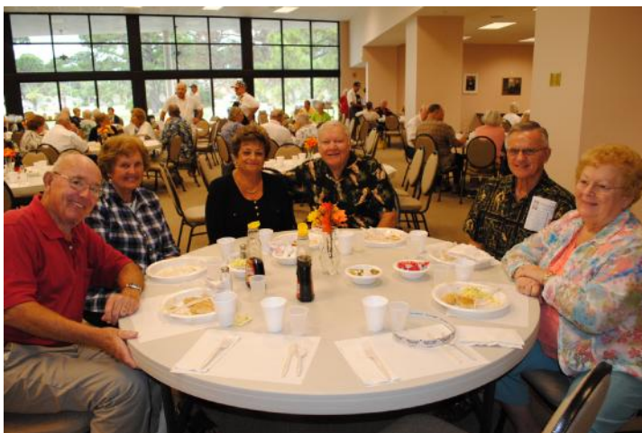
C-34: This table is really enjoying themselves as the drawings are going on.