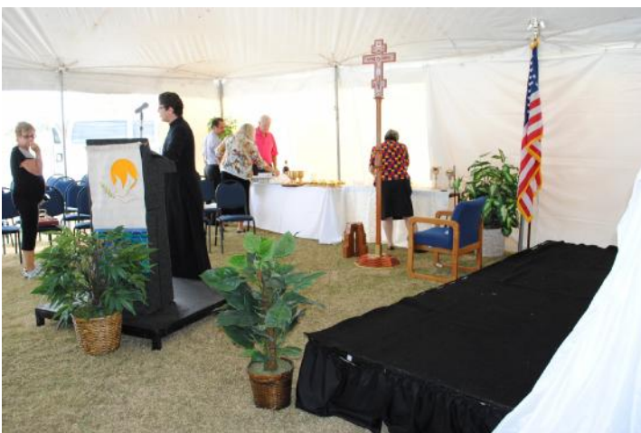
D-10: Workers are preparing for the Mass.