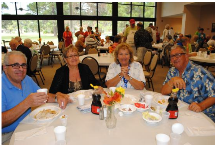
C-29: We thank this table of four for their support of our K of C 11553.