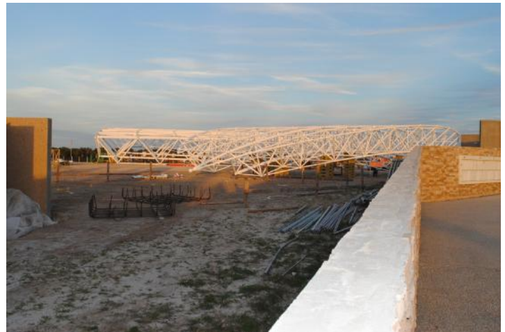
D-33: This white framework will be raised and become the roof covered with a material to make it rain-proof. See next photo.