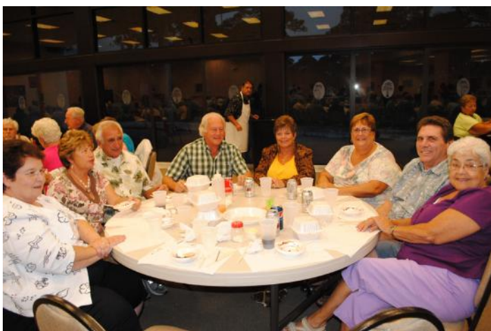
F-25: Thanks to all these good people for supporting The K of C tonight, Nov 15.