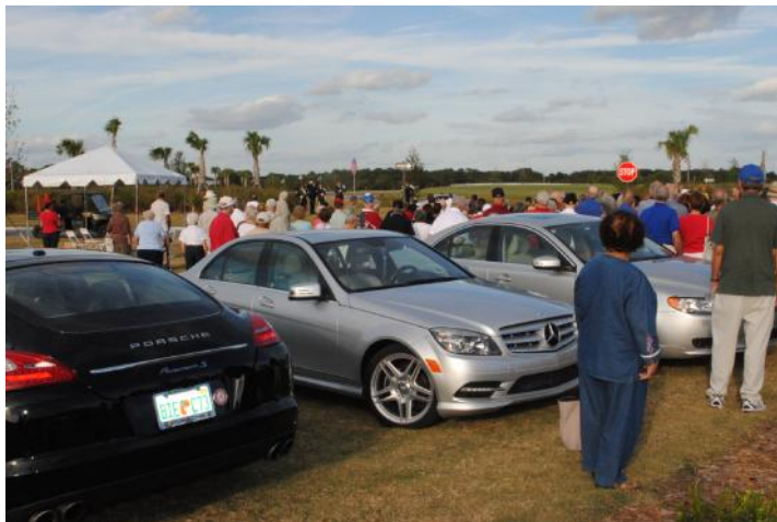
D-21: In the distance the color guard gives a 4-gun salute as the trumpeter plays taps.