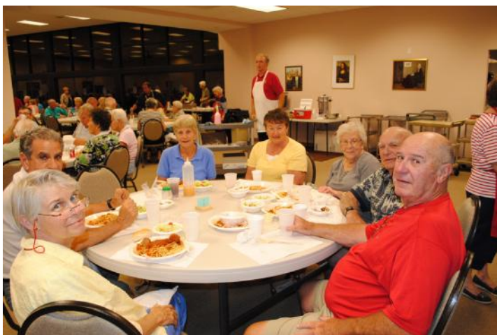
F-35: Glad these seven people could be here for our second Pasta Dinner of our K of C year which starts on July 1 each year.