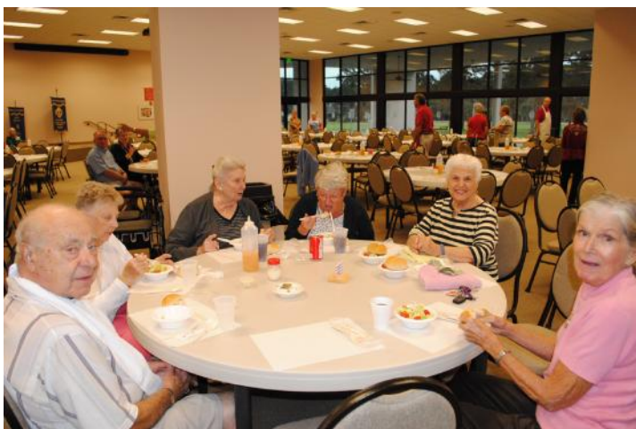
F-05: This table of six have their salads.