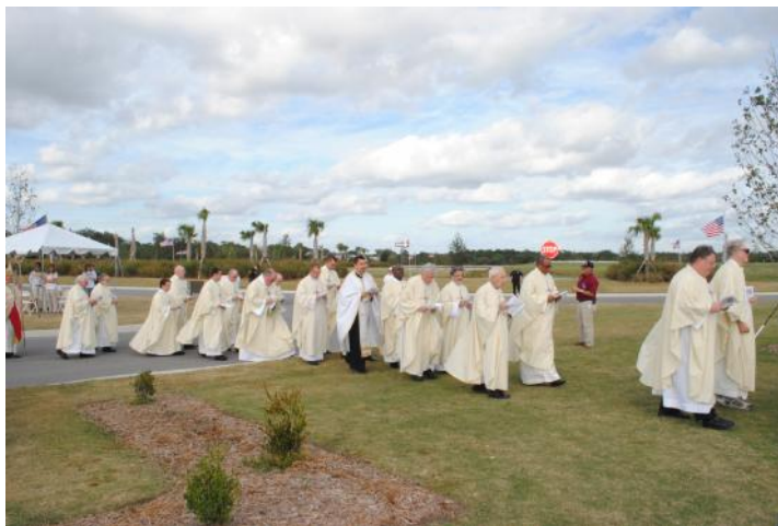
D-17: The procession continues with priests from the area.