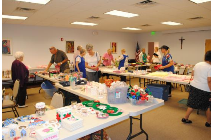
E-09: Customers are coming in to check things over on Friday, Nov 15.