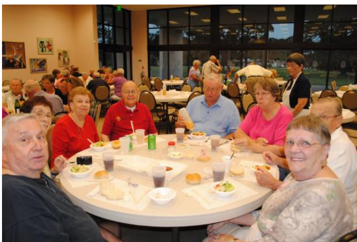
F-14: Most of this table is made up of our K of C members and their wives.