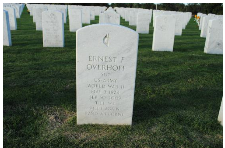
D-29: This icon represents the "United Methodist Church". There are many more religions represented by different symbols.