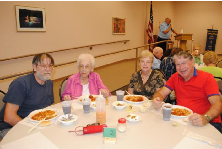
F-17: We thank this table and all the others for supporting our K of C Pasta Dinner tonight.