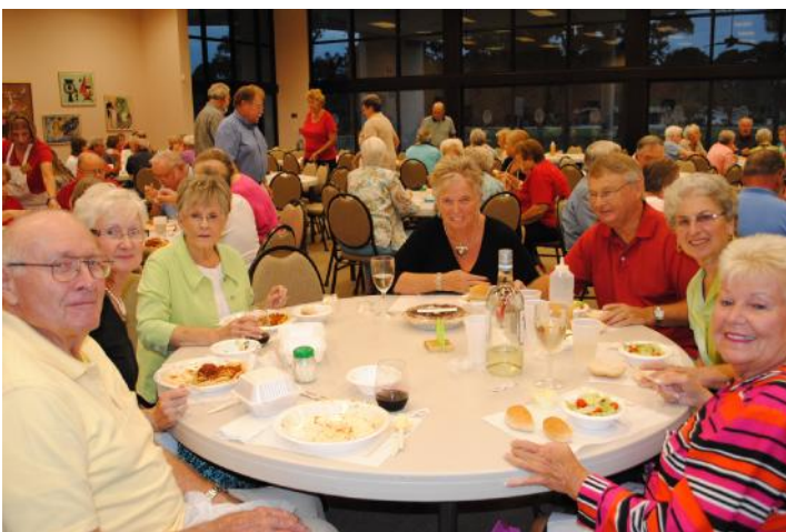
F-19: It's so nice to see happy tables like this one.