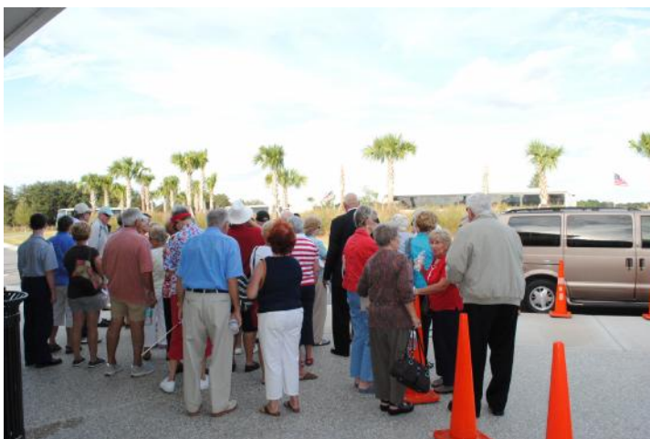
D-22: The ceremonies are all over as people queue up to get the bus back to Twin Lakes Park to get their cars.