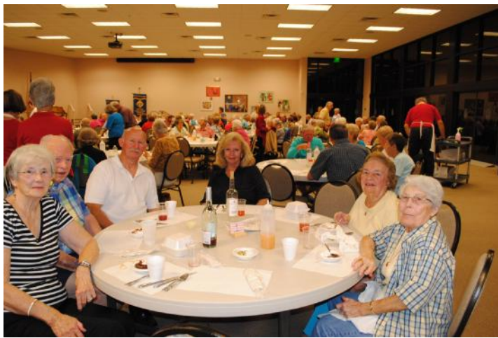
F-34: This table of 6 is just getting started.