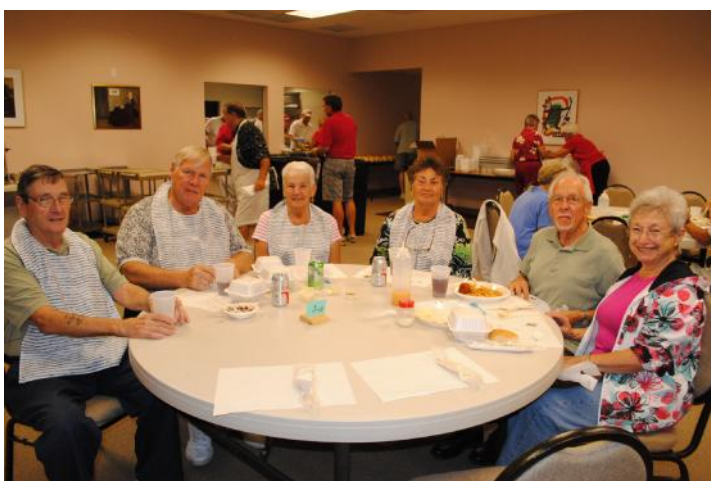
F-37: This is our group with bibs. This is the proper way to eat spaghetti.