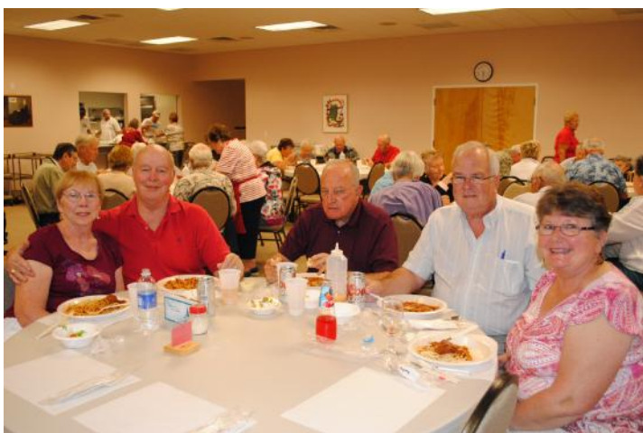
F-23: Looks like these people are in the middle of their spaghetti.