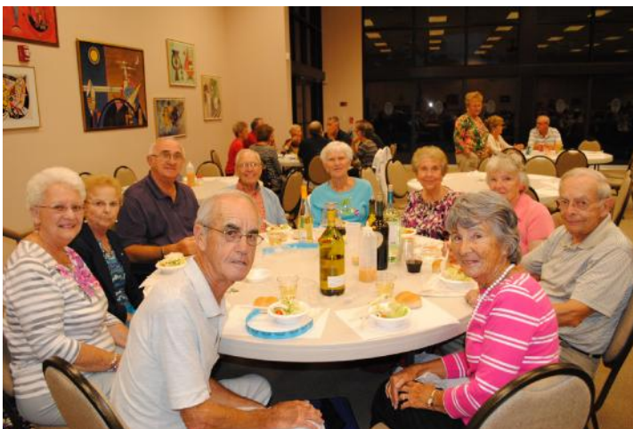
F-30: This is a great table with 10 people around an 8 person table.