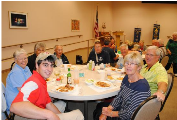
F-46: Another full table of 8. Thanks for supporting the charities.