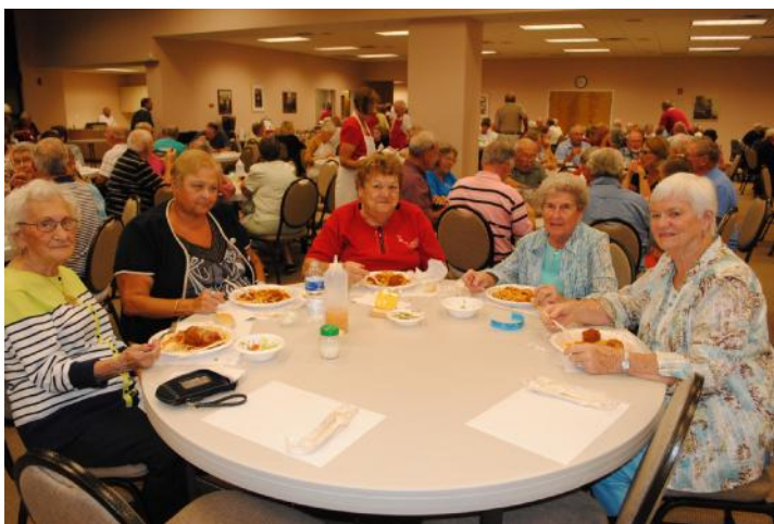
F-29: These five ladies are dressed to the nines and enjoying their pasta.