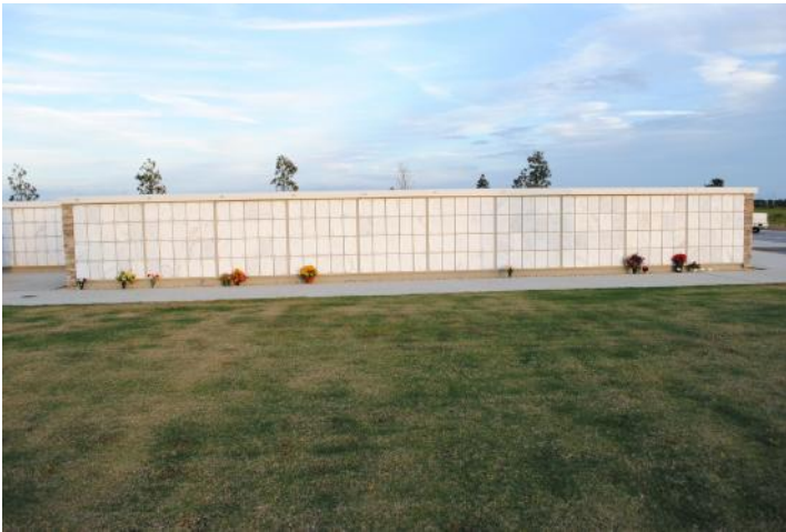
D-30: Here we have the Columbarium Section for the ashes of the deceased. This side of the section is all filled up. Last year there were none.