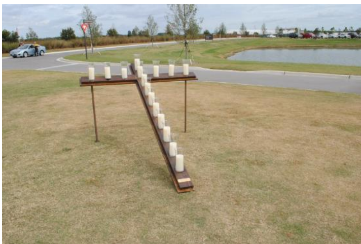
D-04: This is the votive cross.