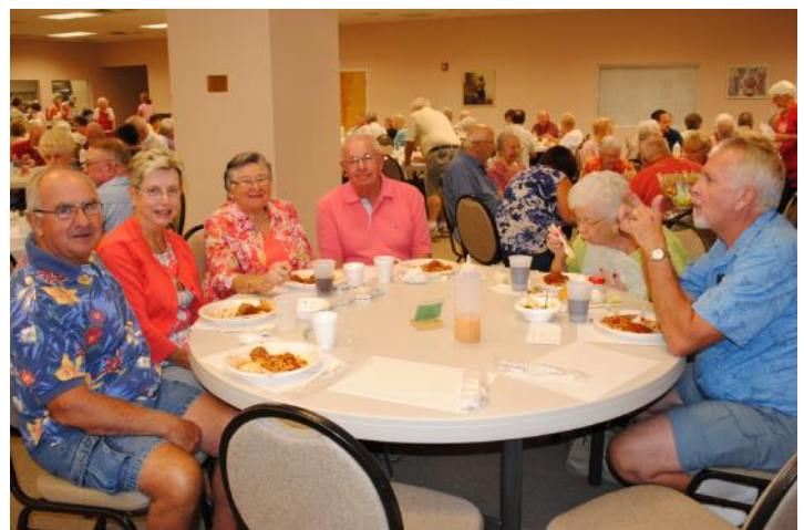
F-20: These people continue to help our cause for charity.