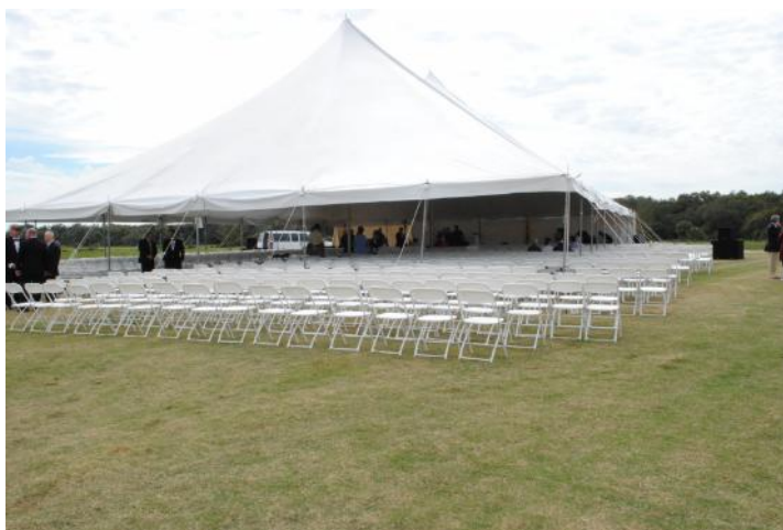
D-05: The tent this year is 10 feet longer than the one used last year. Not many people have arrived yet.