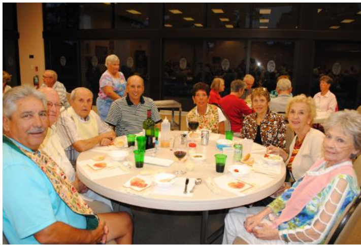
F-28: This table seems familiar as they've been here before. Thanks.