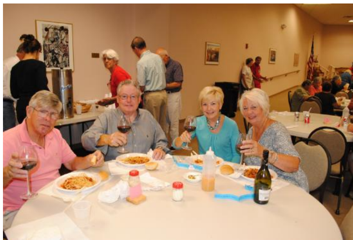
F-40: This 4 decides to have a toast.