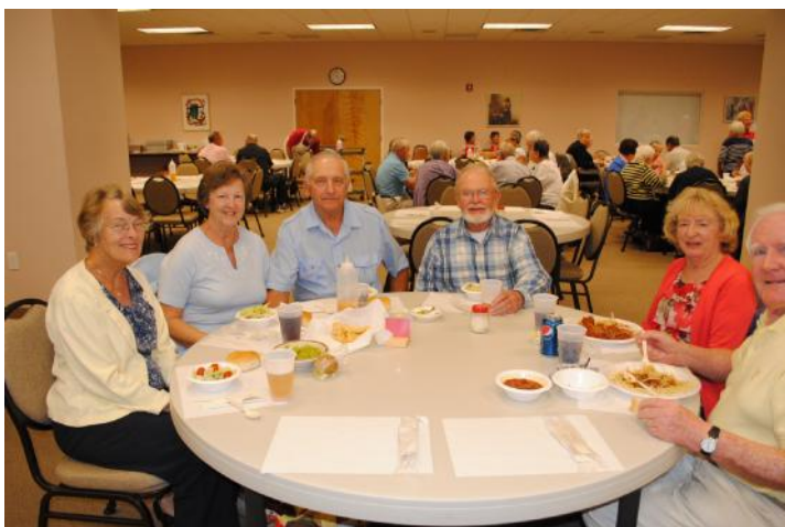
F-11: These people are supporters of our K of C events this year. Our money goes to charities.