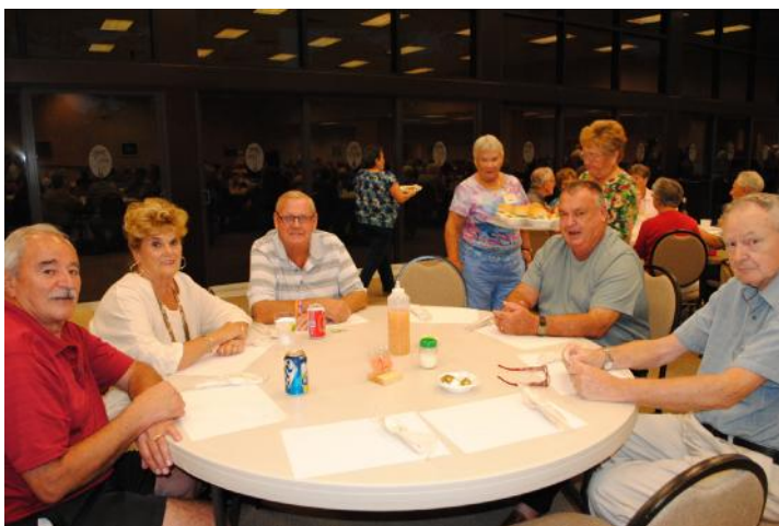
F-31: These people appear to be starting their evening. As you can see in the background, it's getting dark earlier these days.