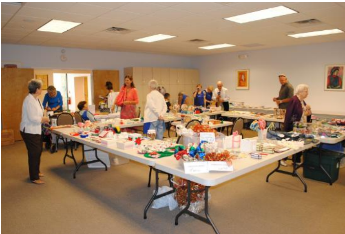
E-10: More customers are perusing the tables.