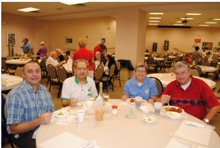
F-04: Here we have some steadfast supporters of our K of C events.