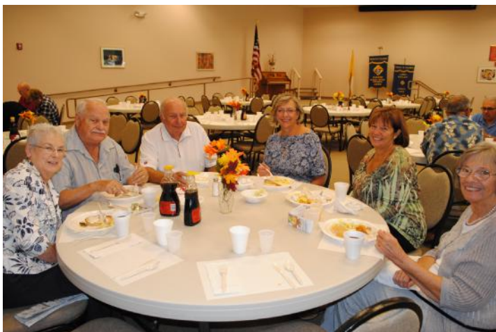
C-30: This table of six is moving right along. Thank you for your support!