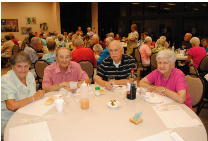
F-33: This is a nice table of 4.