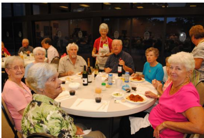
F-26: Here are 8 more people enjoying the pasta to-night.