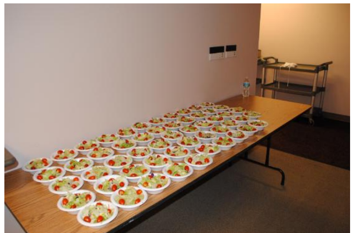
F-02: Looks like the salads are ready to go.