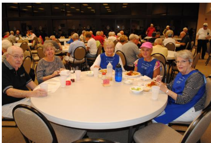
F-44: Here are a few more CCW workers taking a break from the Craft Sale to eat.