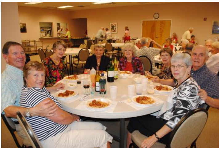
F-45: We've seen these familiar faces before at our events.