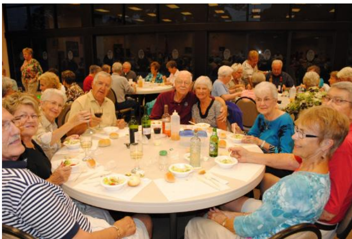
F-27: This table seems to be enjoying themselves. Thanks for your support.