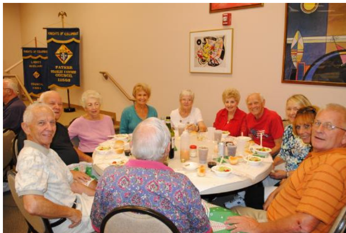
F-42: This is our big table of the night, 11 people at an 8-person table. Nice going.