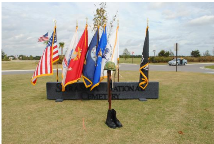
D-03: This is the "Fallen Soldier" display in front of the Military Service Flags.