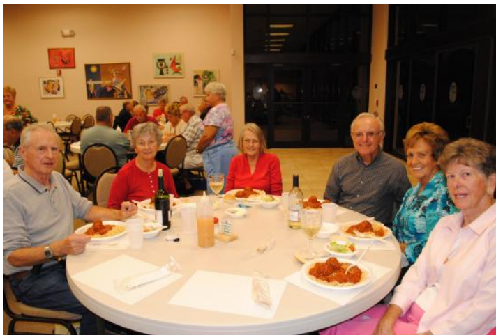
F-32: This is a nice table in the middle of their pasta. Thanks for coming out tonight.