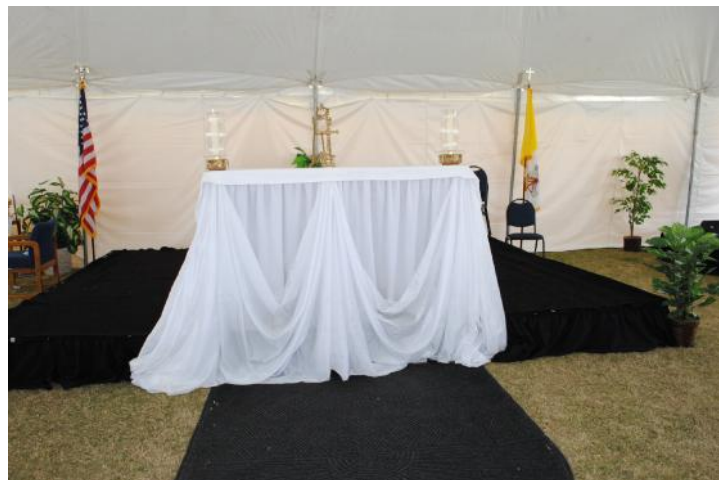
D-09: This is the altar set up for the celebration of the Mass.