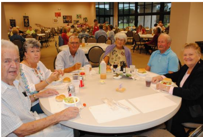
F-09: Salads are always nice to start off a meal. These people seem to be enjoying it.