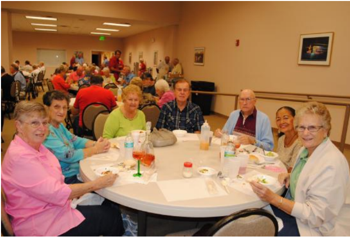
F-15: This looks like another familiar table seen at Our events.