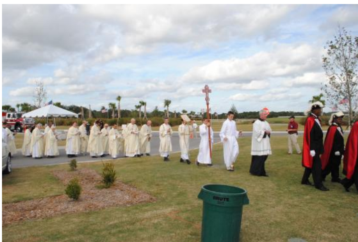
D-16: The procession begins into the tent.