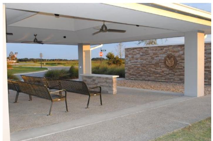
D-35: This is a "burial shelter". This is used for all burial ceremonies before the actual interment. There is little space at the actual burial site.