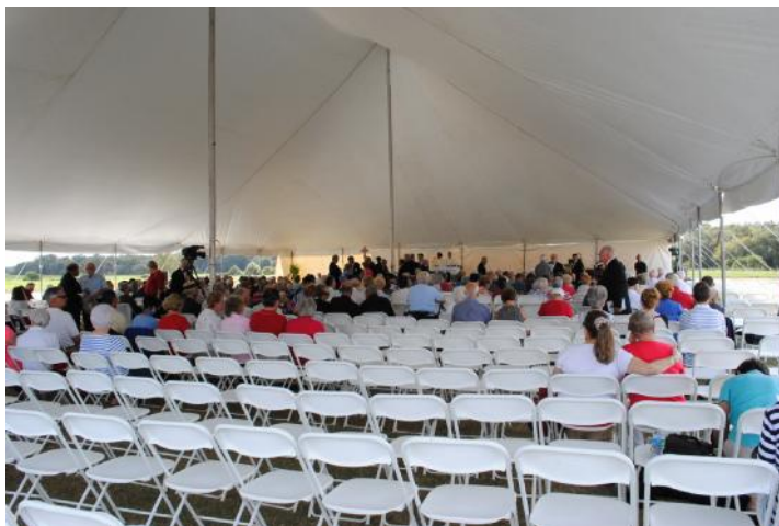
D-13: The tent is slowly filling up.