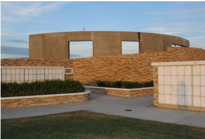
D-32: This Amphitheater was started at the beginning of the calendar year 2013. It will hold about 2800 people with a roof covering it.