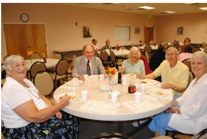
C-32: This is a happy group enjoying their meal.