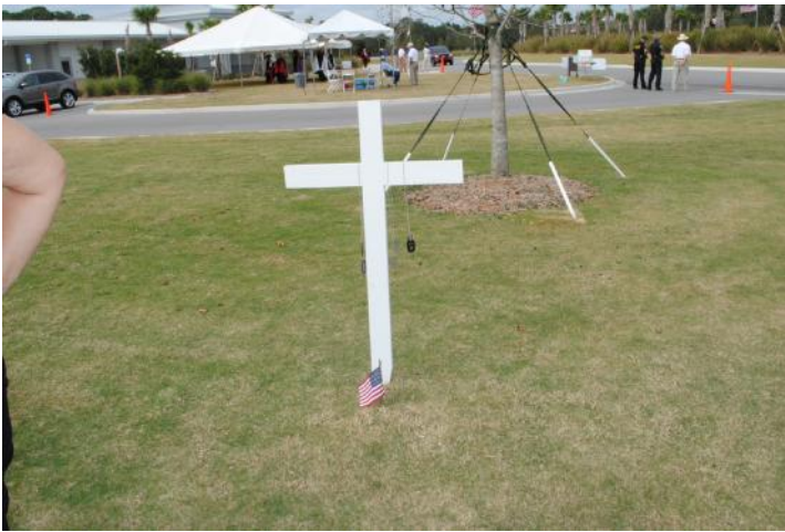
D-06: This cross will be used so veterans can hang their dog tags and have them blessed.