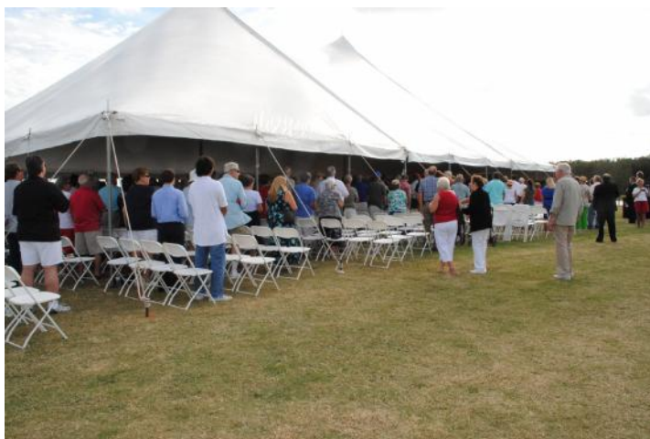
D-15: A rear side view of the tent as it is getting filled to capacity.