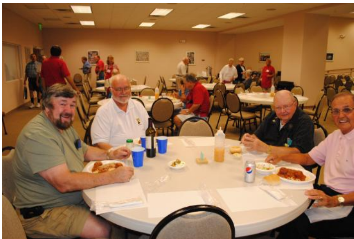
F-03: Four guys are already started on their spaghetti.