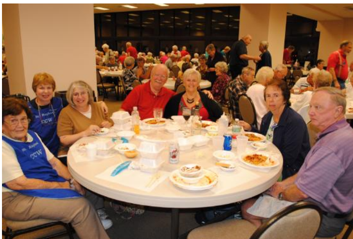
F-39: We see some of the workers from the CCW Craft Sale getting caught up with some food along with some others.