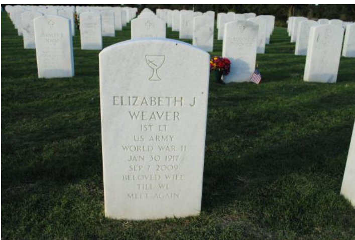
D-28: This icon at the top signifies the "Christian Church".