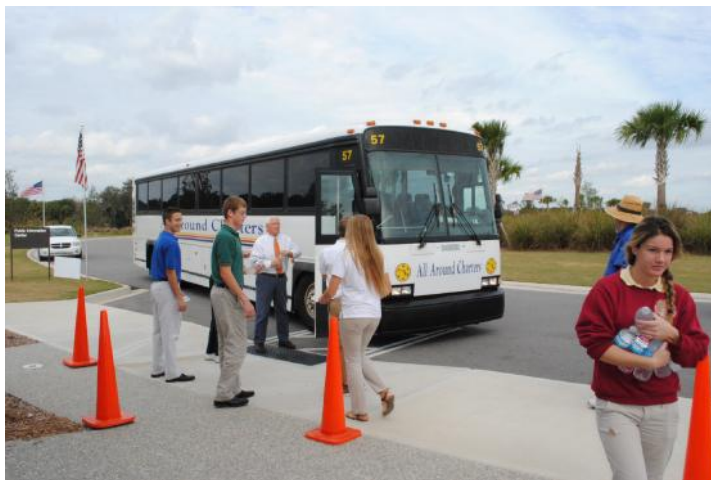
D-01: This is the first bus to arrive at the Sarasota National Cemetery from Twin Lakes Park. People park at Twin Lakes Park and take this shuttle.